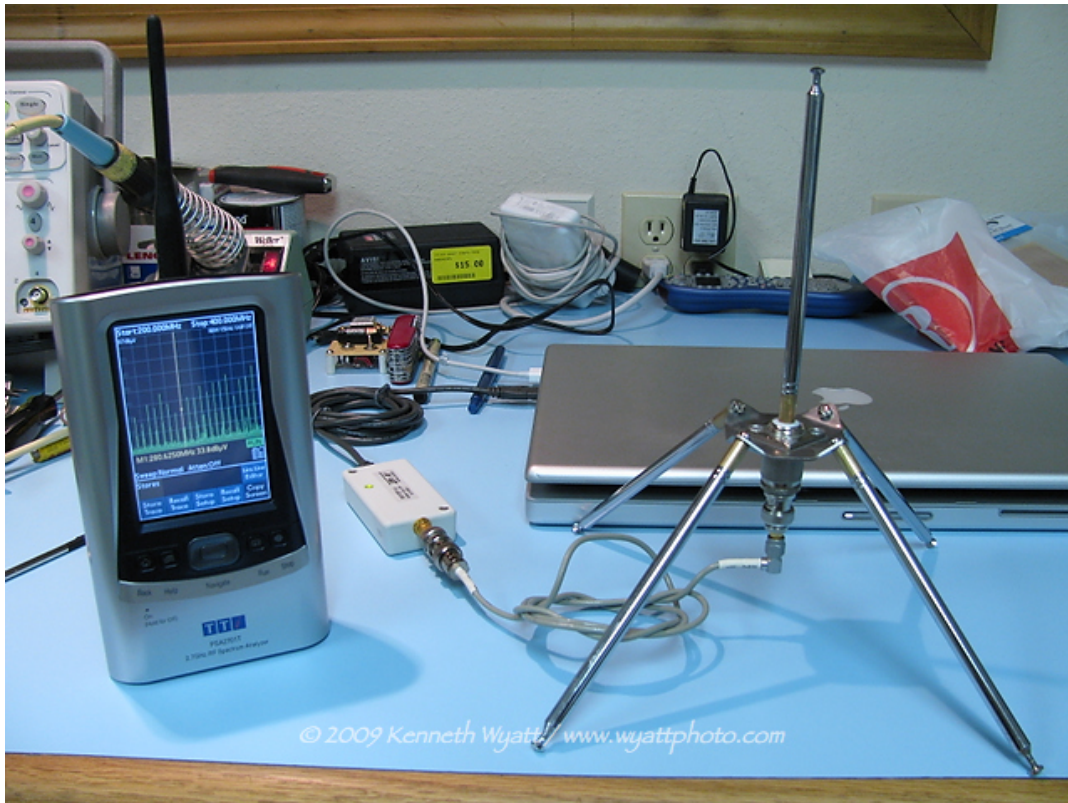
Fig. 3 - Reference antenna used for comb generator testing in the 3m chamber. I'm not sure of the source for this antenna, as it was given to me as a retirement gift by another ham/employee. The elements are telescoping, but I used it in the collapsed state.

into the 3m fully anechoic chamber to record the actual harmonics on professional measurement equipment.