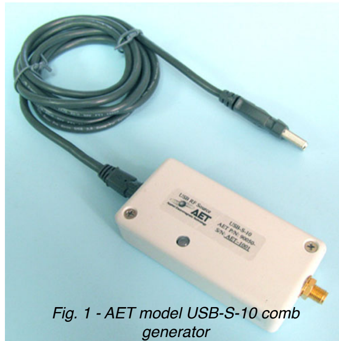
Fig. 1 - AET model USB-S-10 comb generator

Harmonic comb generators are designed to produce fixed harmonics over a wide range of frequencies. Generally, the harmonics are fairly stable in frequency and with temperature, therefore, they may be used as standards for verifying radiated emissions measurement systems in anechoic chambers or on open area test sites (OATS). There are many other uses for these