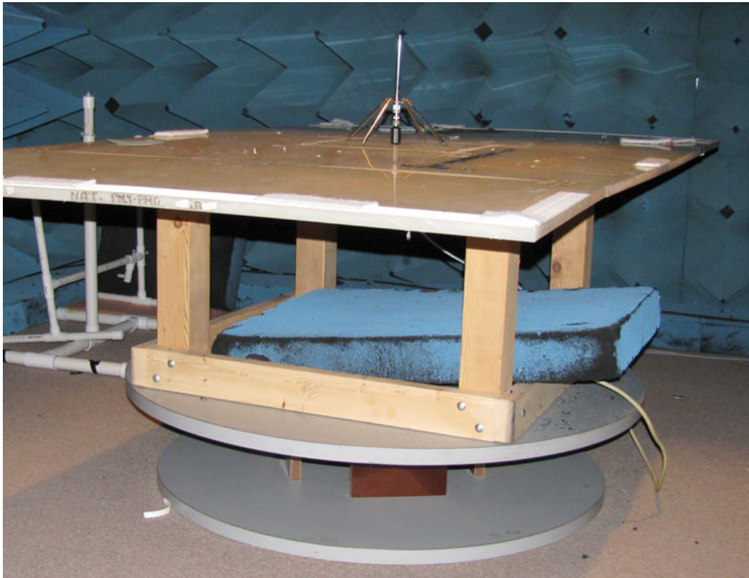
Fig. 4 - Comb generator and antenna installed into a 3m chamber. The comb generator and it's USB power supply were buried under the carbon-loaded foam block. Several ferrite chokes were installed at intervals along the power and coax cables. One of these chokes can be seen at the base of the antenna.

Once the comb generator was installed into the turntable, the generator was turned on and the amplitude versus frequency was measured. Because the turntable was rotated continuously during this measurement, we were also able to capture amplitude versus azimuth as shown in Fig. 5.